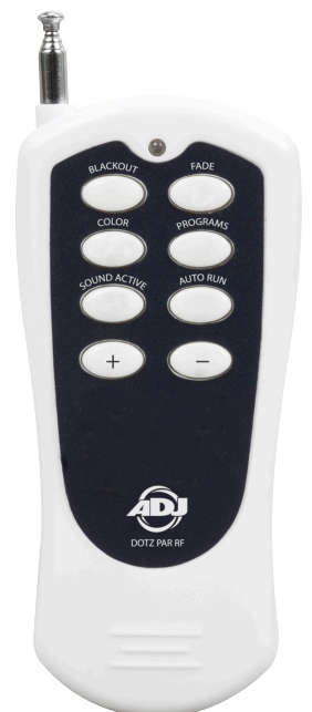
DOTZ PAR RF wireless remote control (sold separately)