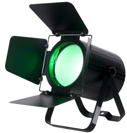
BAR001 - COB Cannon Wash Barn Doors sold separately