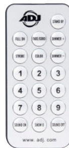
UC IR Wireless Remote Included