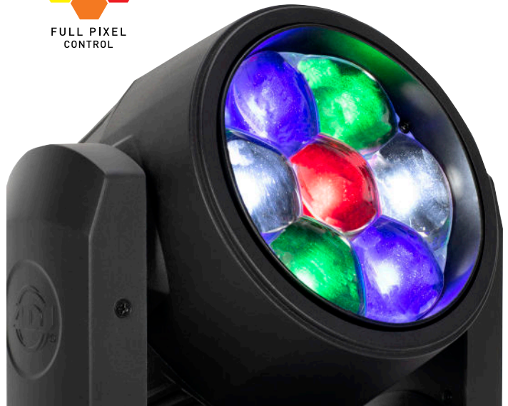
Full Pixel Control