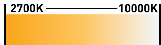
LINEAR COLOR TEMPERATURE CONTROL (TUNABLE WHITE)