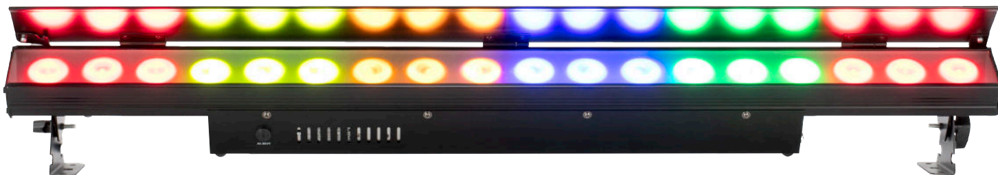
Removable Glare Shield